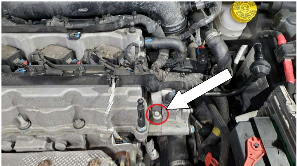
Mount J&L Oil Separator assembly to this location with the same bolt you removed.